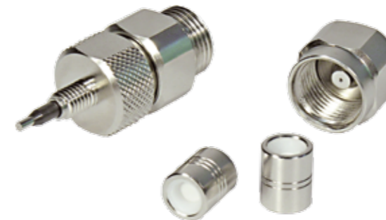
Guard column holder and EC guard columns